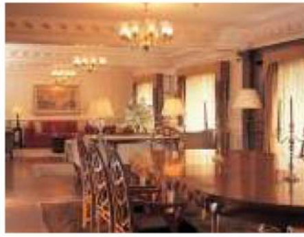
Grand Presidential Suite